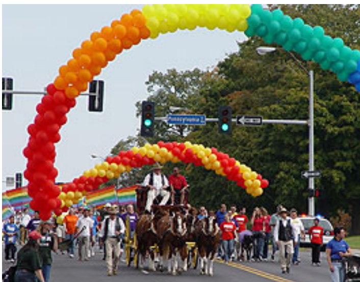
The LGBT Pride Parade in Des Moines, Iowa, opened with the Wells Fargo Stagecoach, accompanied by hundreds of team members.